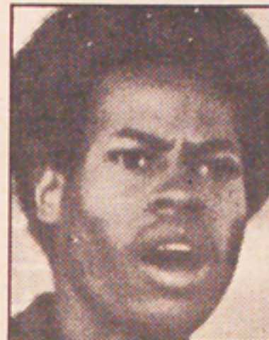
CARL HAMPTON Assassinated: July 28, 1970

Culminating a series of incidents, on July 28, 1970, Houston, Texas police surrounded the Dowling Street area where the People's Party II office was located and attacked the entire Black community. Carl Hampton, chairman and the motivating force of the small organization which followed the example and policies of the Black Panther party, was murdered during the police seige.