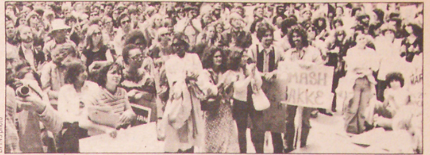
Recent anti-Bakke demonstration in San Francisco

Outrage over the move came to a head at a recent public hearing where over 250 people protested the threatened cutback in medical services to the over 140,000 Black and poor people who use the