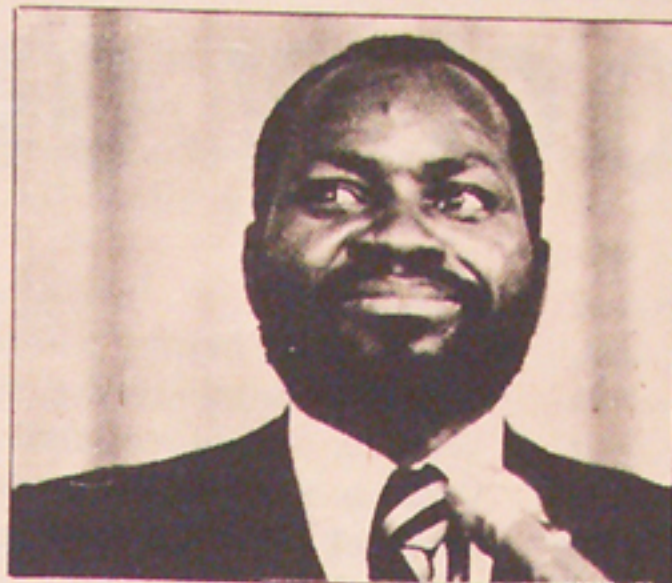
SAMORA MACHEL, president of the People's Republic of Mozambique.

In the field of education, literacy has taken priority and tens of thousands of Mozambicans have learned to read and write since independence. Illiteracy is still widespread, however, and it is planned to train