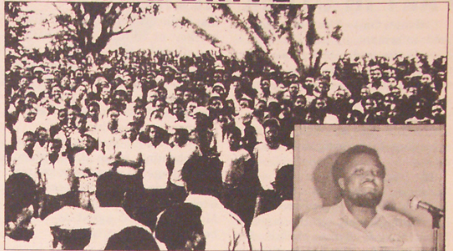
Zimbabwe African National Union (ZANU) members and supporters at mass rally in Rhodesia and ZANU chief representative to the U.N. and U.S., TIRIVAFI KANGAI (inset).

"We must carefully avoid being carried away by emotional feelings of euphoria...it in no way diminishes the greatness of our struggle and of our people and